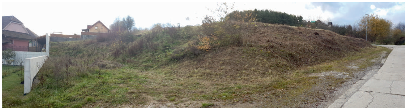
Foto pred úpravou terénu

https://zbgis.skgeodesy.sk/mkzbgis/sk/kataster?bm=zbgis&z=18&c=19.290425,49.215525&it=point&dt=owners#/detail/kataster/parcela-c/812331/630_24?zoom=false