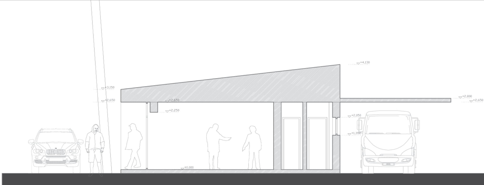
REZ A- A