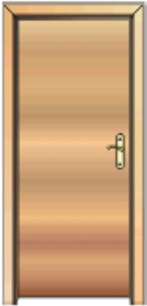
4x60 plus zarubna